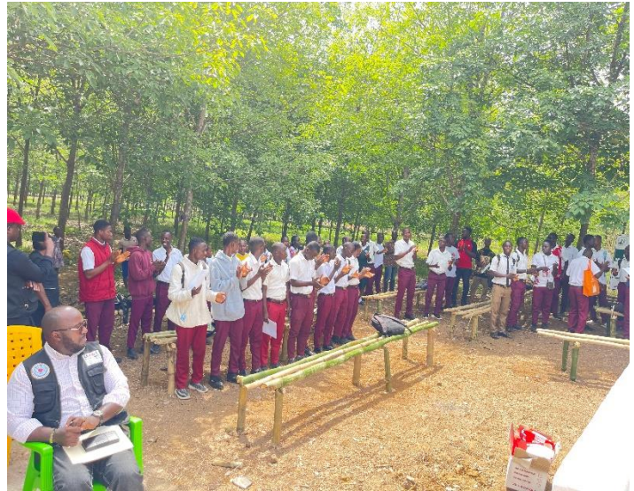
SCENES AT THE CARTER CAMP MEMORIAL SERVICE, HARBEL, MARGIBI COUNTY

MOTTO: Leading the establishment of the War and Economic Crimes Court of Liberia through a holistic and inclusive process in which everybody has a role.