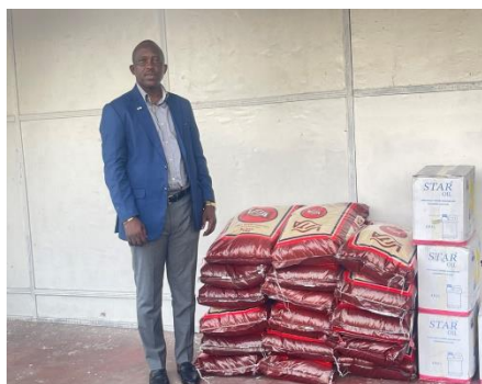
Figure 5 Fig. 7 ED with items distributed to staff