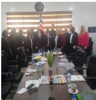
Figure 7: Group photo of OWECC-L Staff and Delegation

(January 19-22, 2025) During the period under review, OWECC_L received a high-power delegation from a US-based anti-impunity organization, the Center for Justice and Accountability.