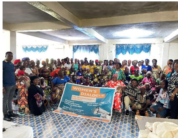
WOMEN'S DIALOGUE IN GANTA, NIMBA COUNTY

MOTTO: Leading the establishment of the War and Economic Crimes Court of Liberia through a holistic and inclusive process in which everybody has a role.