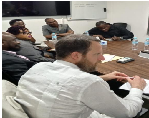
Fig 14; IG Coleman takes note as delegation presents its mission statement

The police also formed part of the weeklong assessment and engagement. The inspector general of the LNP, Gregory Coleman, informed the team of a huge gap in trained manpower capacity building. According to IG Coleman, now is the time to correct said inadequacies, or it could lead to future embarrassment. The IG wants a robust capacity building program for officers earmarked for court operations. As it stands according to the IG, the police lack the capacity for any special court operation and used the time to call for a massive capacity building.