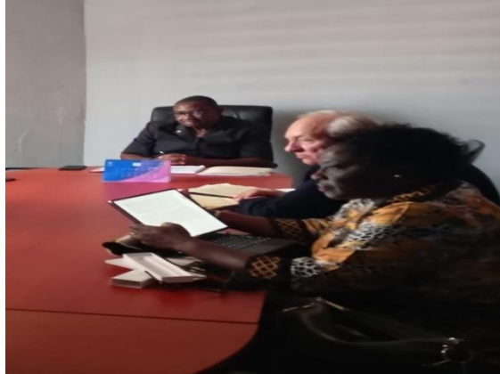
Fig 13: Minister Tweh plays host to the delegation at the office

He pledged to work with stakeholders in dealing with impunity, especially in the transitional justice process.