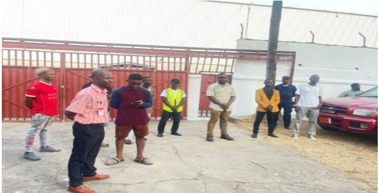
Fig.8: Staff gathered to receive their package

The ED Christmas gift came as an appreciation to the staff for their participation in a daylong facelift of the premises of the OWECC-L.