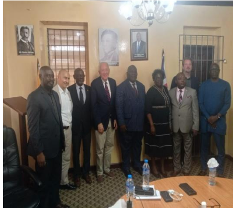
Figure 8: LNBA official in group photo with delegation

At the engagement with the Ministry of Justice, Minister Oswald N. Tweh recommitted the government of Liberia to fully supporting the OWECC-L in reaching a final closure to the country’s bitter past as recommended in the TRC.